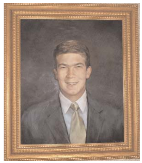
Above: Painting of Dan in Alumni Lounge